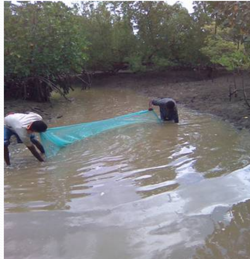
Seining in the mangrove creek