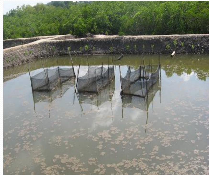
Hapas in experimental ponds